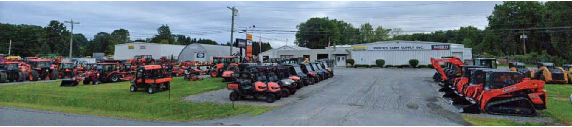
Pictured are White’s Farm Supply Inc.’s Canastota (above) and Waterville (right) stores.