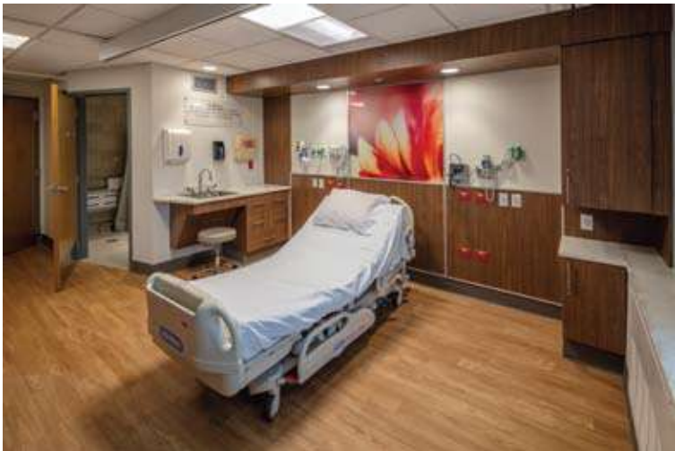
Pictured are two of the patient rooms, part of the $7.6 million renovations completed at the medical-surgical unit at Oswego Hospital.

ovation of this space since it was built in 1969; each patient room offers a “hotel-like” feel and is equipped with a new HVAC filtration system purchased through HealthWay Family of Brands that will greatly improve the indoor air quality within the patient rooms. Each floor provides com-