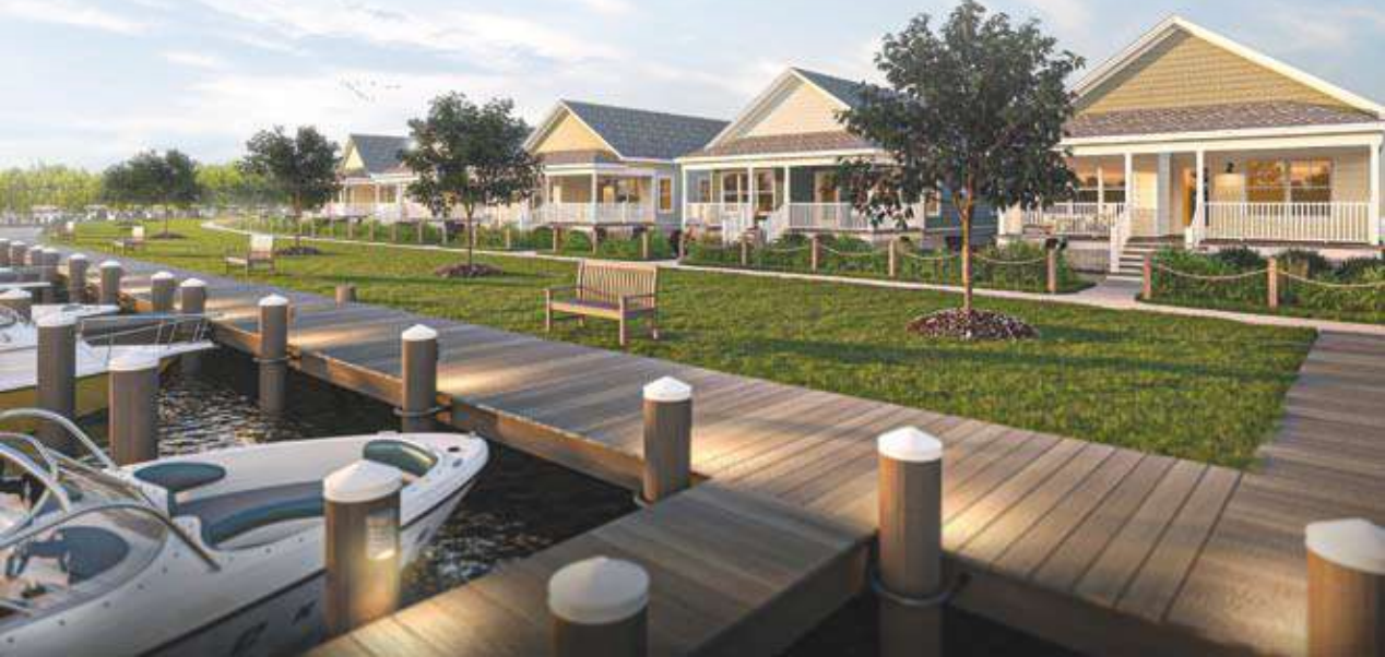
SUBMITTED PHOTOS Exterior renderings of The Cove at Sylvan Beach, including a few of the cottages and docks, Sylvan Beach Supply Co. and the pool and playground.

New CNY staycation spot set to open, will feature rental cottages with boats, partnerships with local businesses